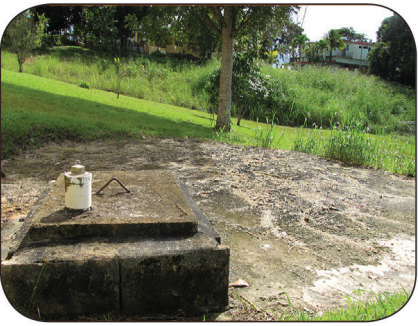
Keep septic tanks sealed.