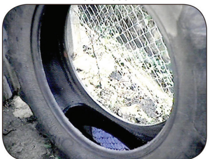
Recycle used tires or keep them protected from rain.