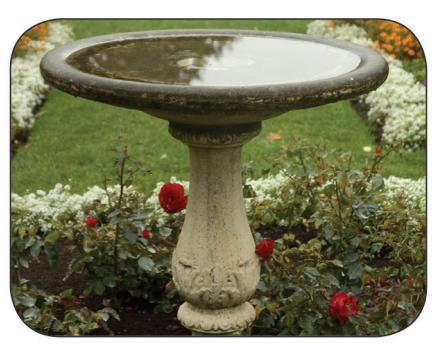
Empty standing water from fountains and bird baths weekly.