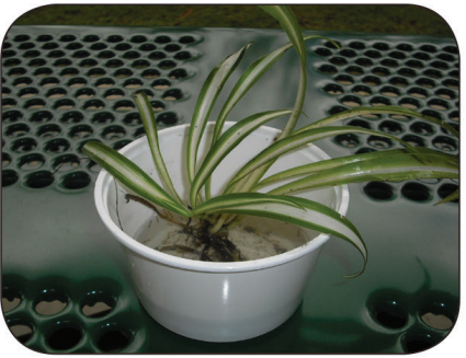
Put plants in soil, not in water.