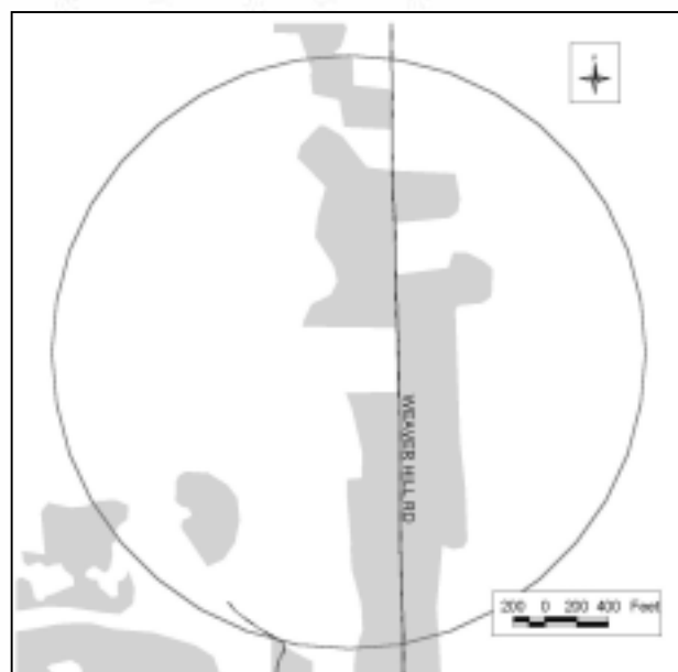
Figure 2. Areas of high-intensity land use are shown in dark gray.