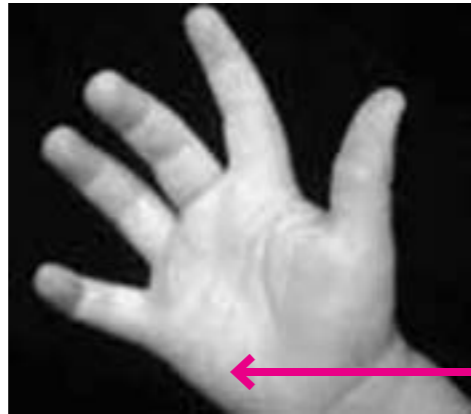
Right-hand application site