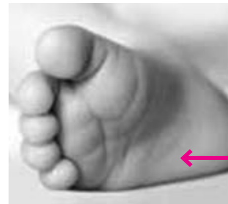
Foot application site