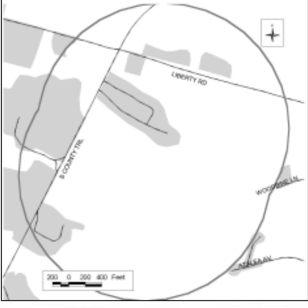
Figure 2. Areas of highintensity land use are shown in dark gray.