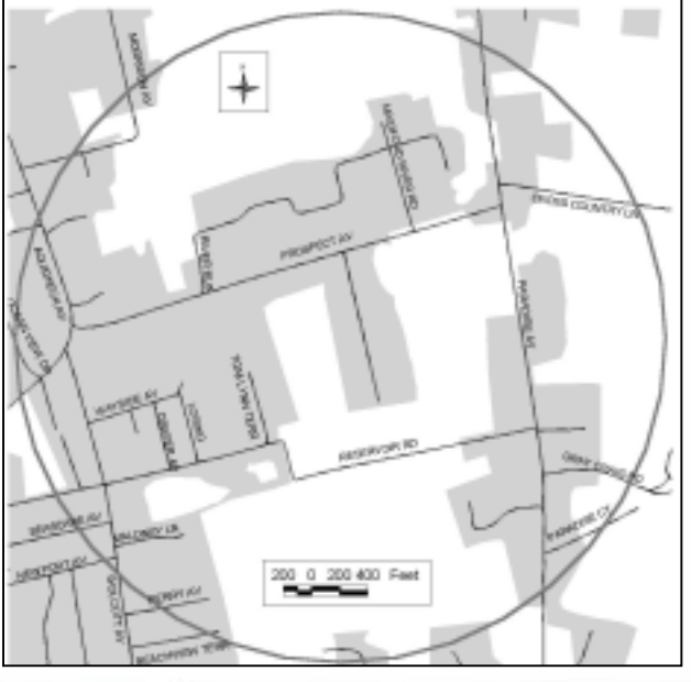
Figure 2. Areas of highintensity land use are shown in dark gray.