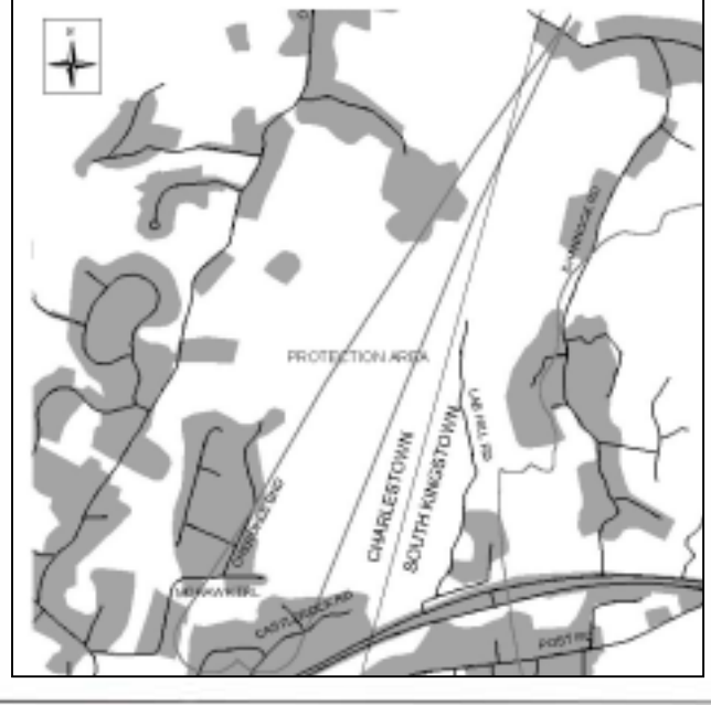
Figure 2. Areas of highintensity land use are shown in dark gray.