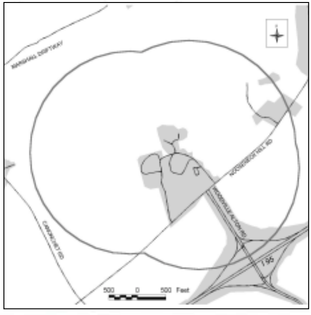
Figure 2. Areas of highintensity land use are shown in dark gray.